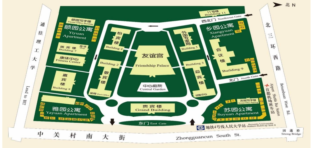
Plan of Beijing Friendship Hotel